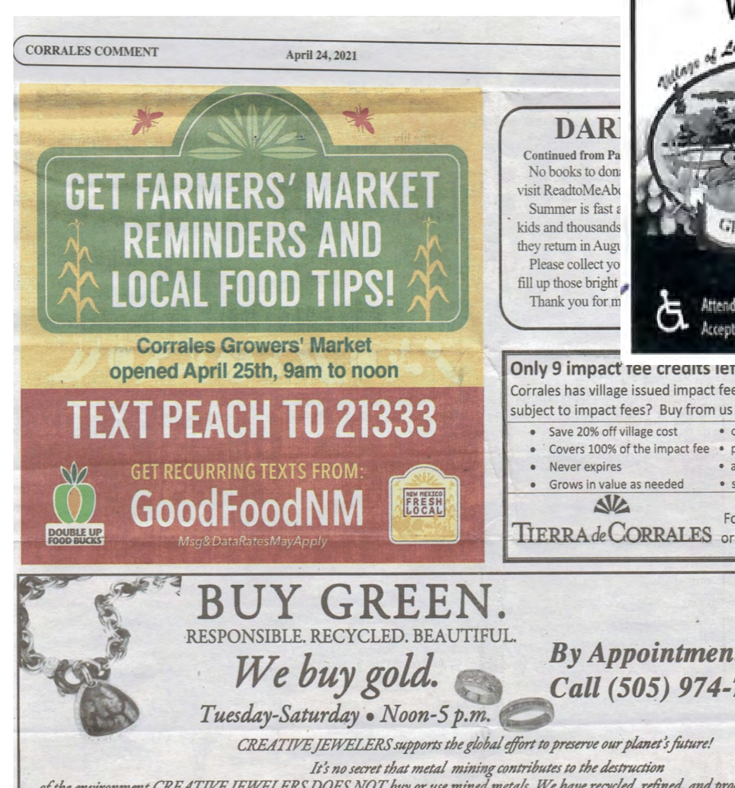
Los Ranchos Growers' Market bulletin ad, paid for with Promotional Funds. (Above)