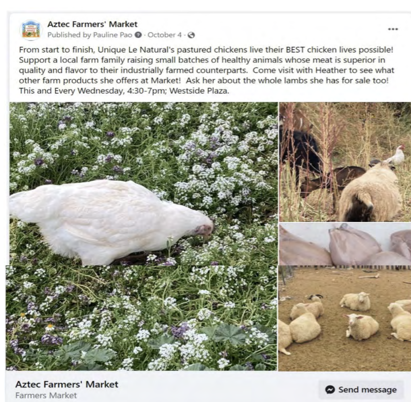
Aztec Farmers' Market Facebook ad, paid for with Promotional Funds.